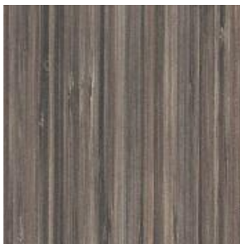
Smoked Sugar Cane*